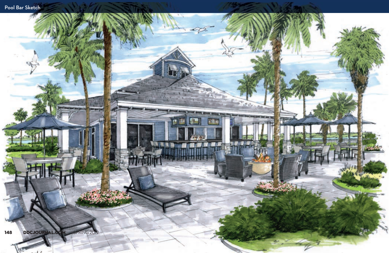
Pool Bar Sketch

OUR VISION AND MISSION WAS to reshape an existing 1,361-acre farm field into a residential development, surrounded by newly created conservation lands consisting of flow-ways and wildlife corridors.” -Ray Blacksmith