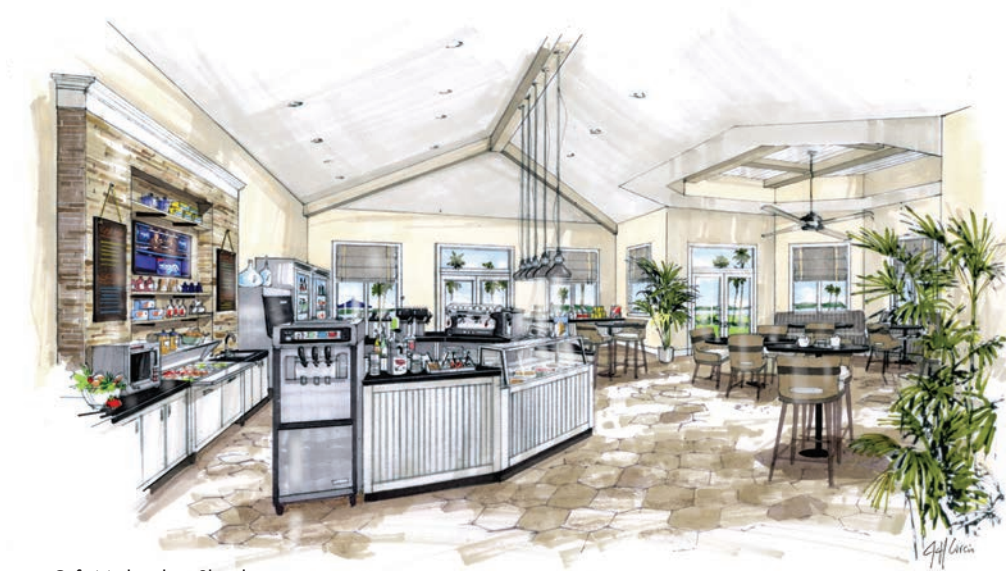
Cafe Marketplace Sketch